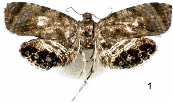
Figure 1. Compsocommis vietnamensis , n. sp., female holotype (14.5mm wingspan). From: Heppner, J. B., Bae, Y.-S. 2015. Compsocommis new genus, with a new species in Vietnam, and transfer of Mictocommis to Archipini (Lepidoptera: Tortricidae: Tortricinae: Archipini). Zootaxa 3999: 144–150.

Sample figures from two tortricid papers published in 2015.