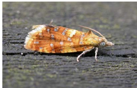
Adult of Pseudargyrotoxa conwagana